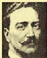
J. Bruce Ismay

Our apologies to anyone whose name was omitted because of printing deadlines